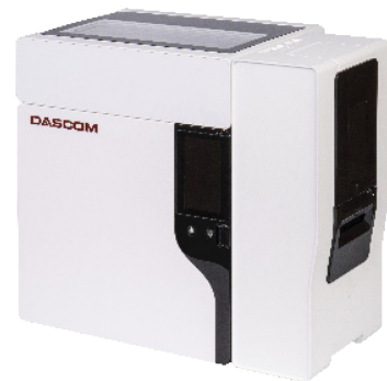
Double Bin model

DASCOS GB Ltd Hart House, Priestley Road Basingstoke | Hampshire RG24 9PU | ENGLAND Tel.: +44 1256 355 130 | Fax: +44 1256 481 400 info.gb@dascom-com | www.dascom.co.uk